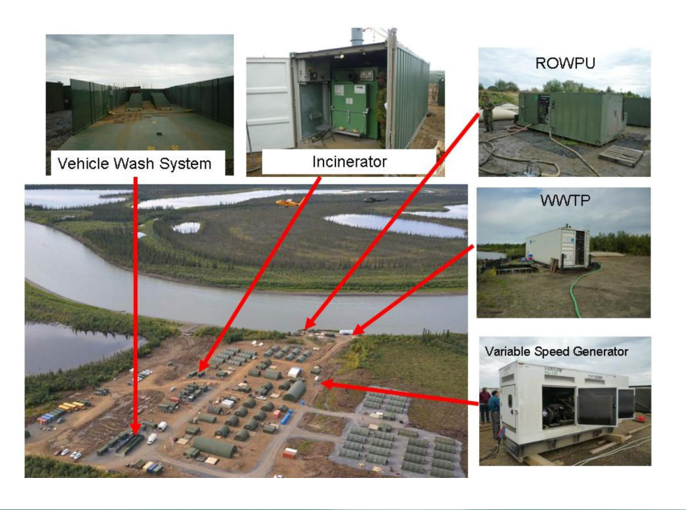
Figure 1. Op NANOOK employs sustainable technology at its main camp in Inuvik, NT

The vehicle wash station was recently procured by the Canadian Armed Forces and Op NA-NOOK 12 was the first opportunity to demonstrate the newly acquired system. Designed to wash all types of military vehicles, the vehicle wash station is designed to recycle 100% of the water used during the vehicle wash operations. Given the scarcity of water at many deployed locations, this acquisition will prove to enhance the Canadian Forces commitment to Environmental Protection and sustainable camps. The ability to recycle the majority of water in one system will have a follow-on effect of reducing the fuel consumption of water production units.