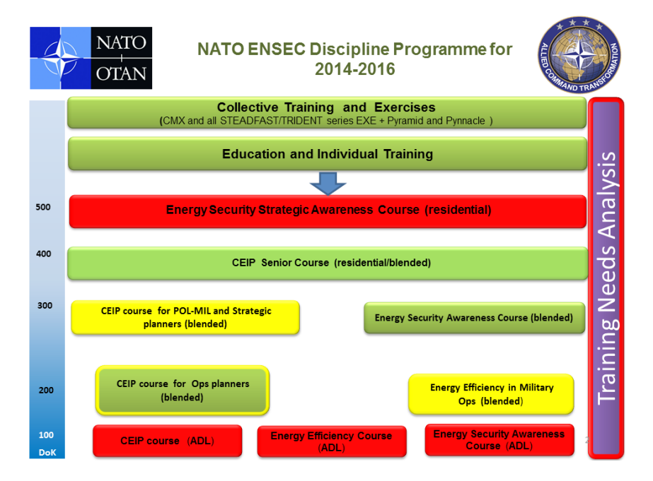
Figure 5. NATO Energy Security Discipline Programme

• Develop an Energy Efficiency in Military operations course (DoK 200). ENSEC CoE is to investigate and seek solutions from training institutions which were identified during the